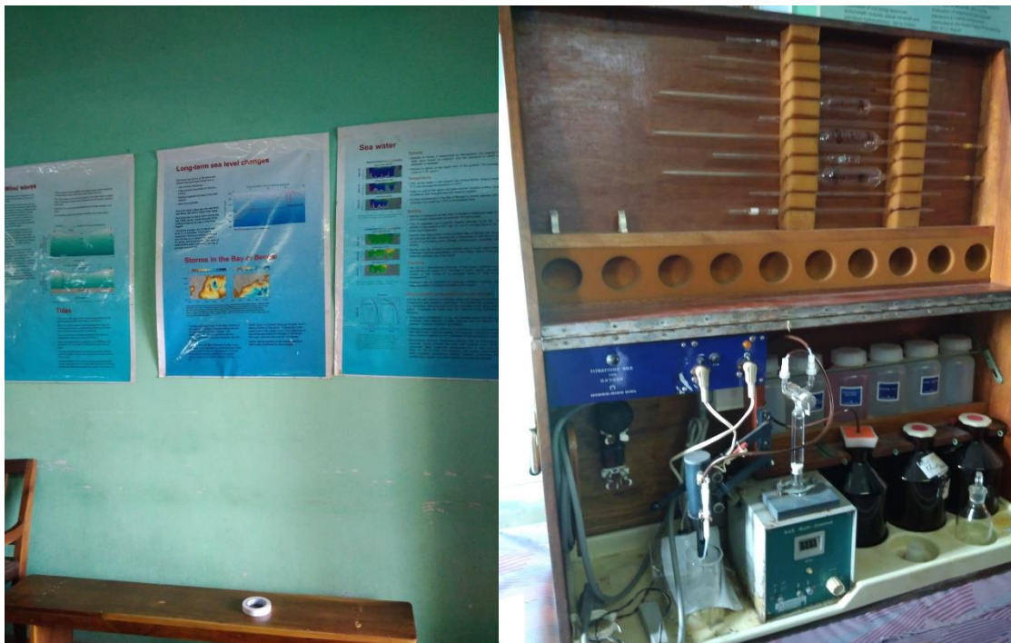
Various stages of exhibition